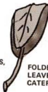
FOLDED LEAVES BY TREE CRICKETS, CATERPILLARS, ALSO SPIDERS