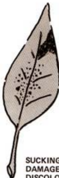
SUCKING INSECT DAMAGE, LEAF DISCOLORATION (ALSO THRIPS & MITES)