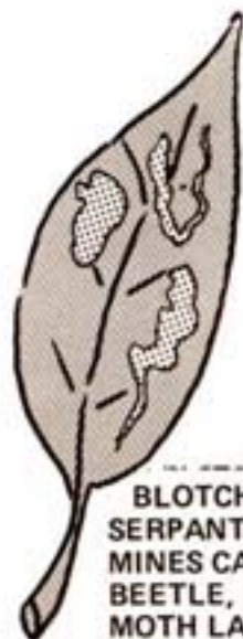
BLOTCH OR SERPANTINE LEAF MINES CAUSED BY BEETLE, FLY, OR MOTH LARVAL