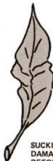
SUCKING INSECT DAMAGE, LEAF DEFORMATION (APHIDS, PSYLLIDS)