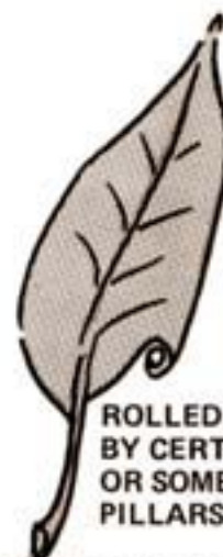
ROLLED LEAVES BY CERTAIN MITES, OR SOME CATER- PILLARS